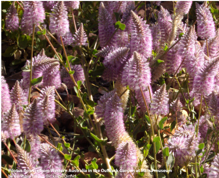
Ptilotus flowers from Western Australia in the Outback Garden at Mt Isa museum