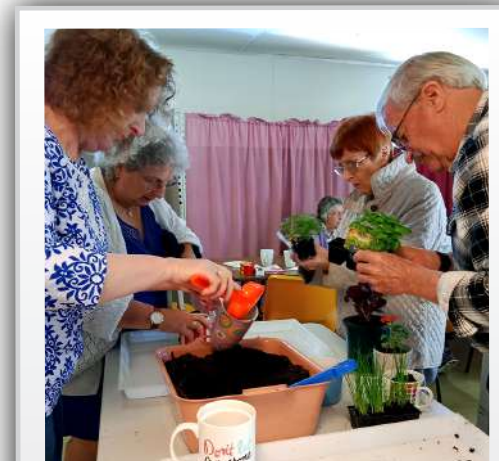
Spring planting at St Marty's!