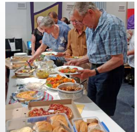
Church Dinner at St Marty's!

This monthly group has just commenced and meets in the community centre. It provides a chance to pause, catch your breath enjoy the camaraderie, creativity and a cuppa. Members are from both the church and the wider community and each gathering has a different theme.